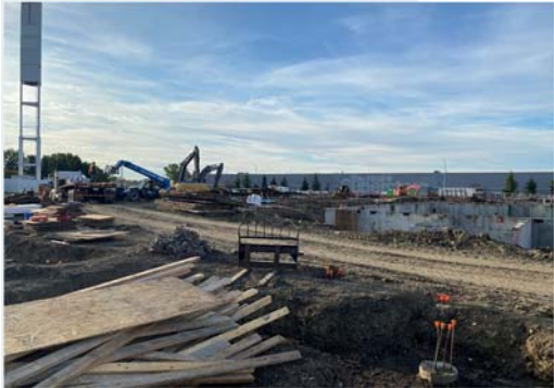
Grace Village Construction—September 2021

Construction is well underway at our new Grace Village location with the foundation poured, water line is on site, and other utilities are in process. Most of the walls are already built and ready to be installed as soon as the go ahead is given. The Geo-thermal heating system is underway, and progress is good. A few hiccups and delays but Synergy assures us that they hope to gain the time a little further into the project. The anticipated completion date is summer of 2023, pending no further delays – so hopefully two years from today’s date, I’ll be writing for the newsletter from the Grace Village Location. We are still struggling to get the live feed working for public access, so once that’s ready, we will circulate the link.