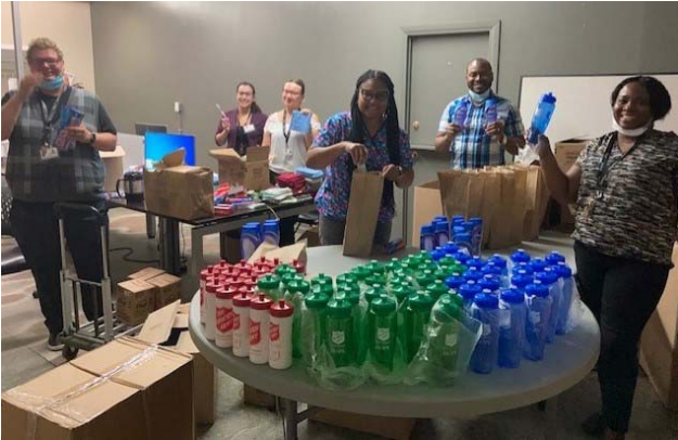
Community Support Services Team

Many community members that crossed our paths echoed sentiments of gratitude towards our services and gifts. Some even commented on how delicious the meals tasted with comments such as “my compliments to the cook”. Lunch in the Park 2021 brimmed with positivity and purpose.